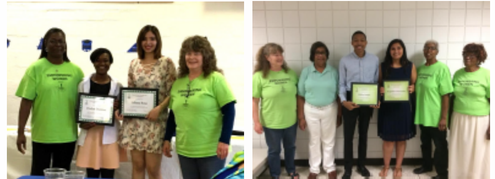
Past scholarship winners receiving their awards