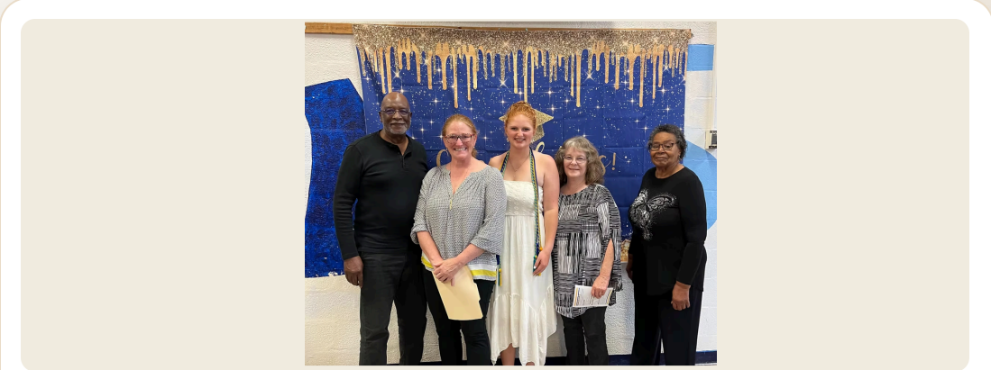
2025 SCHOLARSHIP RECIPIENT

♥ Supporting graduating seniors from Northampton & Accomack counties