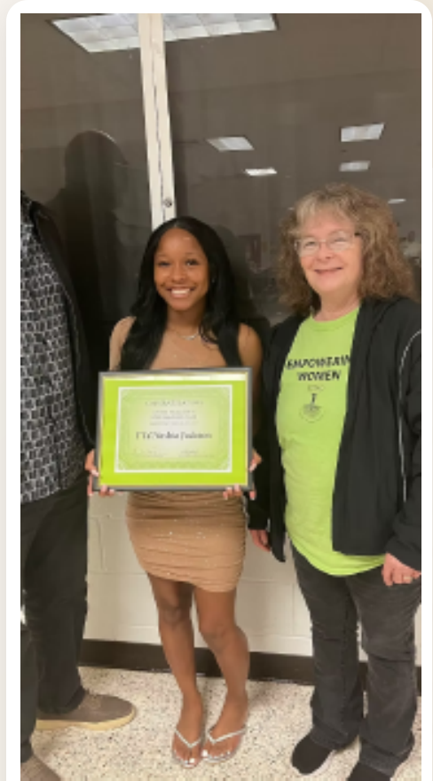
2025 Scholarship Recipient

ESTACI is a 501(c)3 nonprofit organization